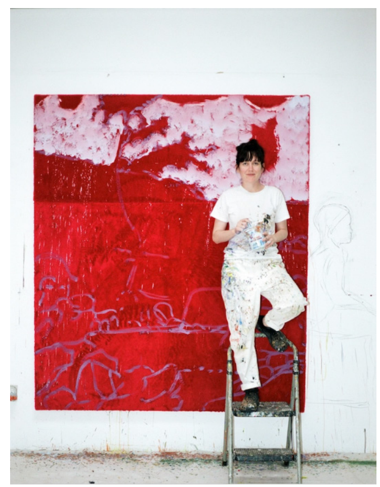
Installation view of "Claire Tabouret: I am spacious, singing flesh,"

CT: The setting of the Palazzo, being right on the canal, brought out some hidden dialogues between the works that feel as though they were waiting to be discovered. There are nearly 20 years between the oldest and newest works in the show—they were made during such different times in my life. I'm always thinking about the next