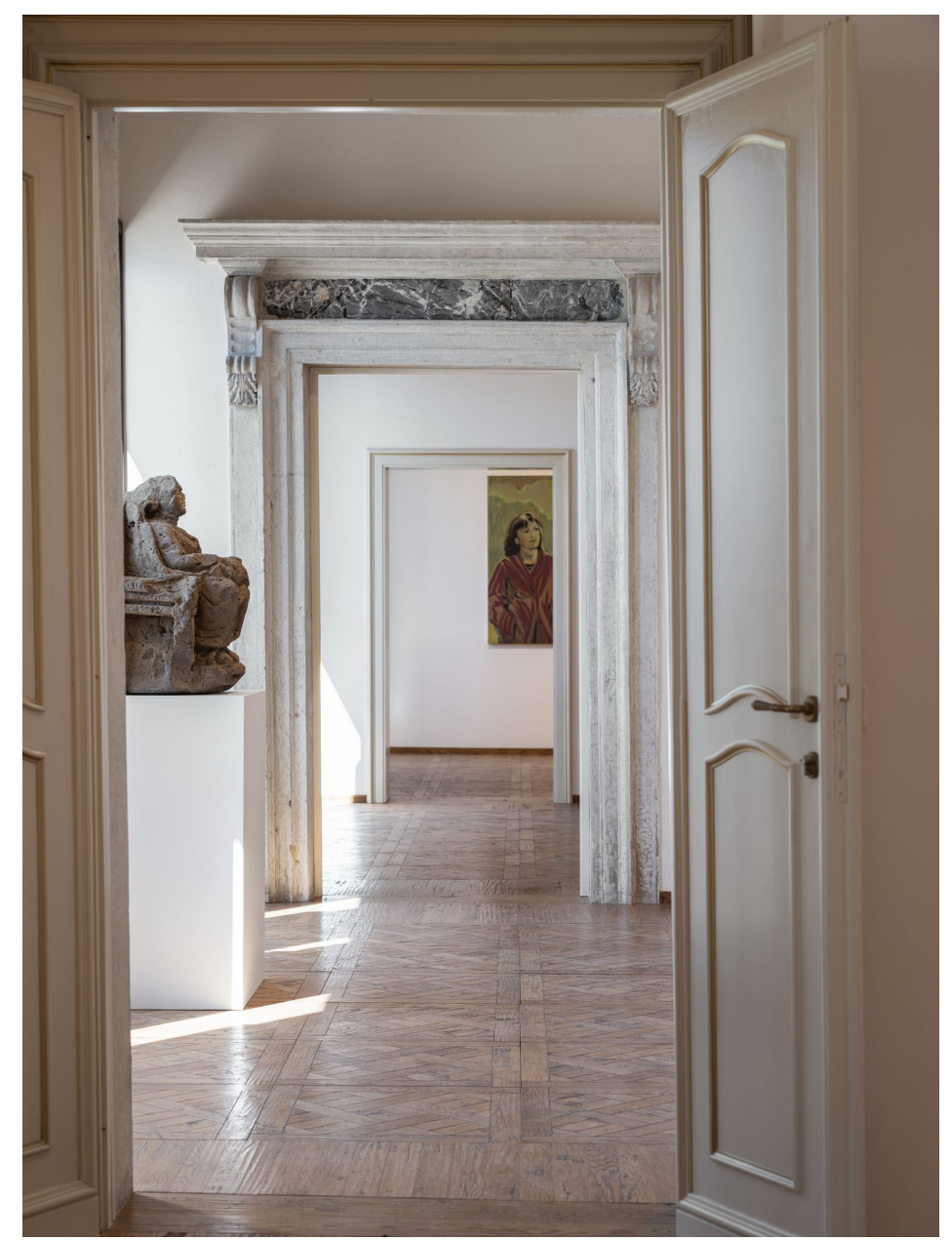
Installation view of "Claire Tabouret: I am spacious, singing flesh," photo by Ugo Carmeni, © Claire Tabouret, courtesy of the artist and Almine Rech.

CT: We have less time for ourselves with a child, so there is a great radicality and immediacy in the way we use this time when it arises. It's a constraint in a way, but of course, it's also expansive and transformative. I wanted this show to reflect that tension, the feeling of being in a dynamic state of change.