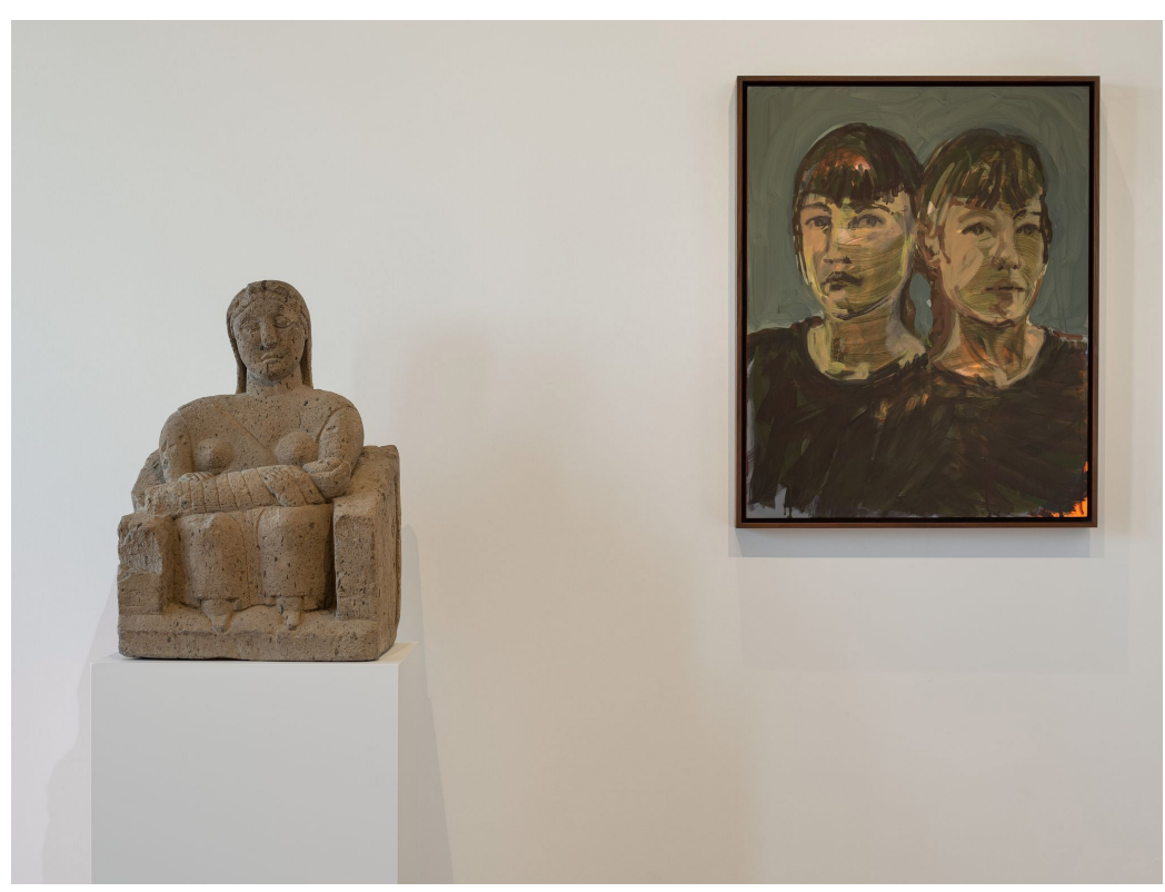
Installation view of "Claire Tabouret: I am spacious, singing flesh," photo by Ugo Carmeni, © Claire Tabouret, courtesy of the artist and Almine Rech.