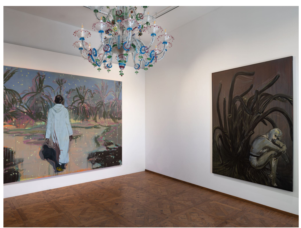
Installation view of "Claire Tabouret: I am spacious, singing flesh," photo by Ugo Carmeni, © Claire Tabouret, courtesy of the artist and Almine Rech.