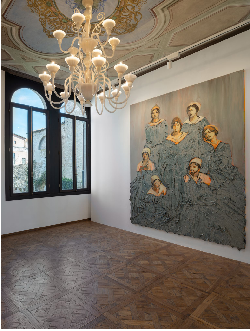
Installation view of "Claire Tabouret: I am spacious, singing flesh," photo by Ugo Carmeni, © Claire Tabouret, courtesy of the artist and Almine Rech.