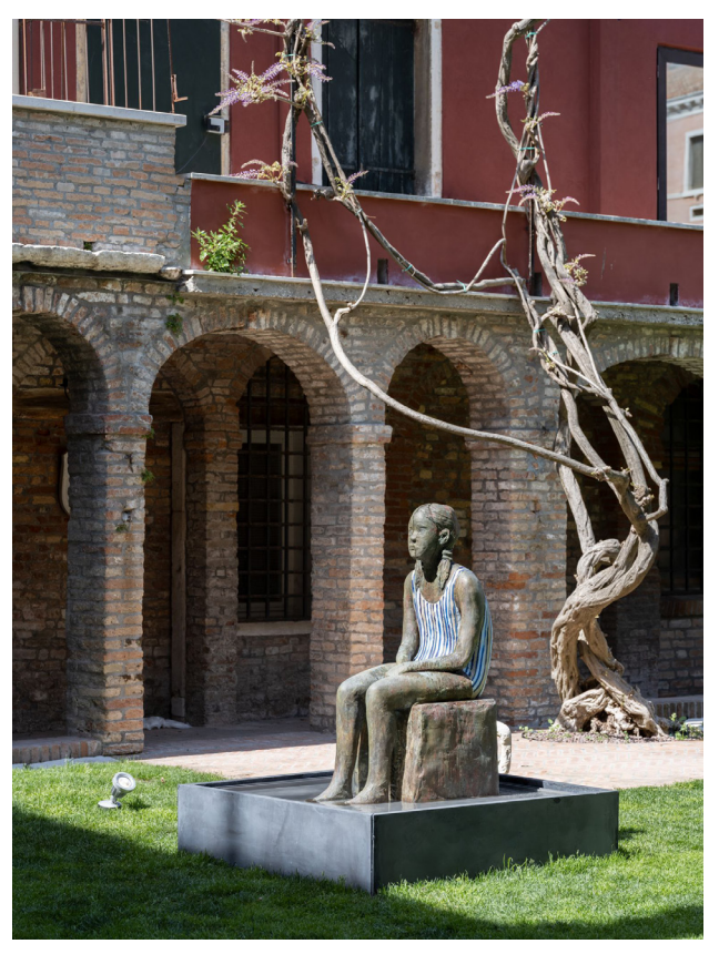
Installation view of "Claire Tabouret: I am spacious, singing flesh," photo by Ugo Carmeni, © Claire Tabouret, courtesy of the artist and Almine Rech.

WW: The exhibition looks at the theme of transformation in your work. What is your relationship to transformation in your practice?